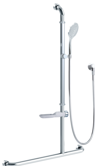
Drawn RH (Right Hand)